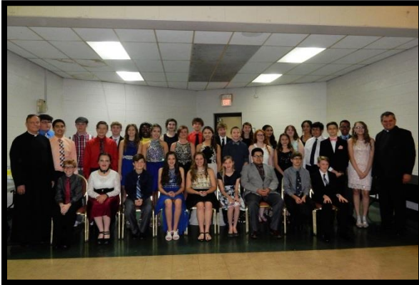
2017 Eighth Grade Graduation